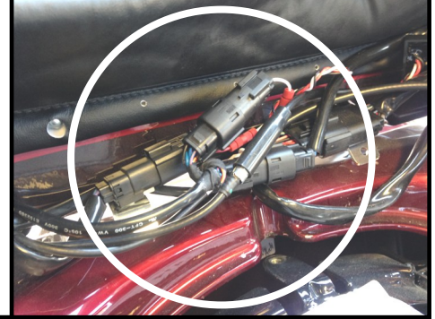
Tour Pak Connector Location