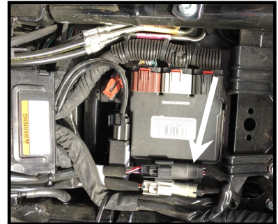
2014-2020 Street Glide®/Road Glide®, Street Glide®/Road Glide®/Road King® Special