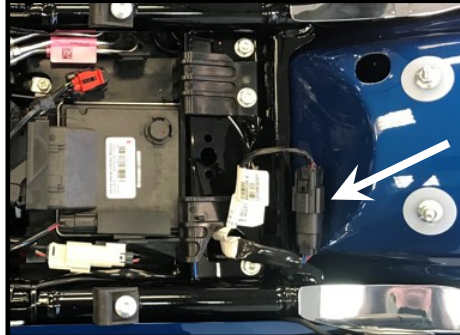
2021-Later Street Glide®/Road Glide®, Street Glide®/Road Glide®/Road King® Special