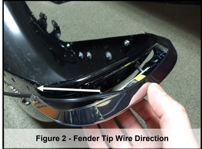
Figure 2 - Fender Tip Wire Direction