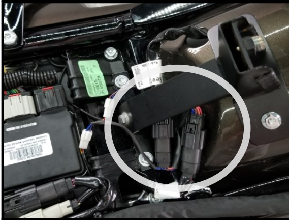
Harness Connector Location—Top Rear Fender

For: Road King, Electra Glide Ultra Classic, Electra Glide Ultra Classic Lo, Electra Glide Ultra Limited, Electra Glide Ultra Limited Lo, Road Glide Ultra CVO